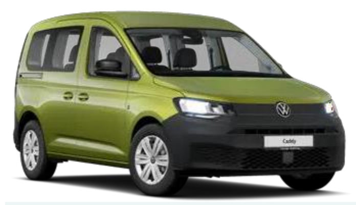
Overview LCA Caddy Kombi