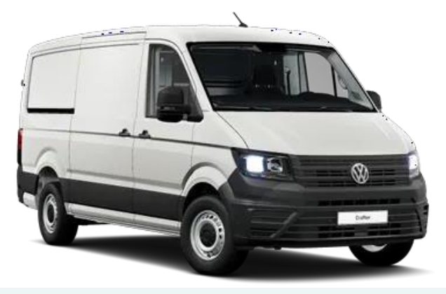
Overview LCA Crafter 103 kW

Vehicle: Crafter 3,5 t KAST MR 103 kW FroSG6 Configurations: market Germany, model year '21